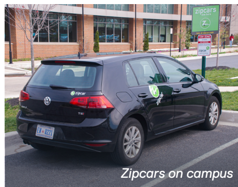
Zipcars on campus