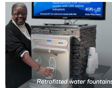
Retrofitted water fountains