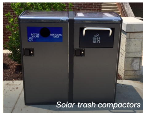
Solar trash compactors