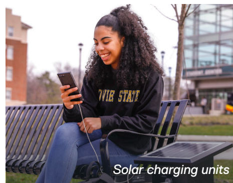
Solar charging units