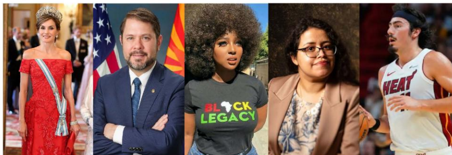
Queen of Spain