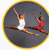
ALVIN AILEY American Dance Theater