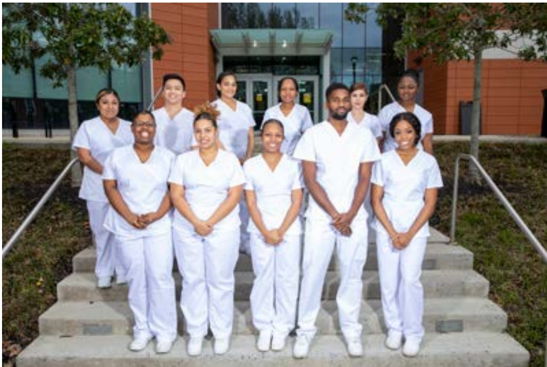
The Undergraduate Class of Spring 2022