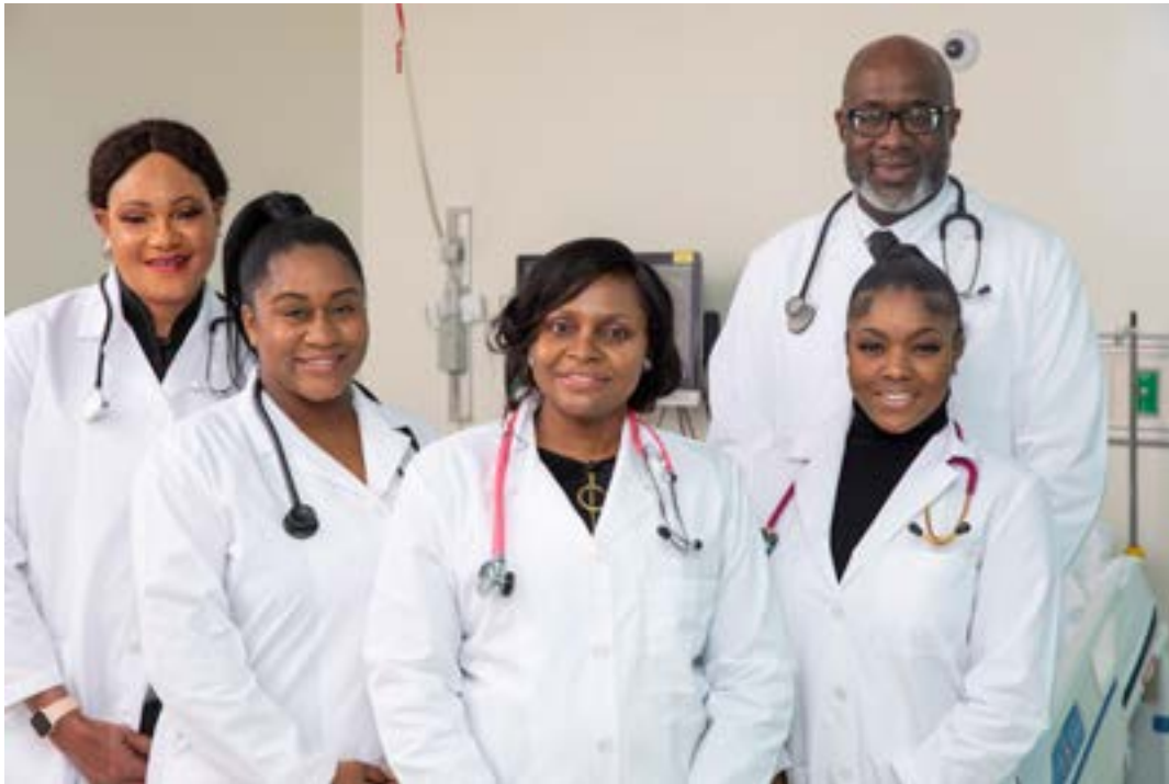
The Graduate Class of Spring 2022