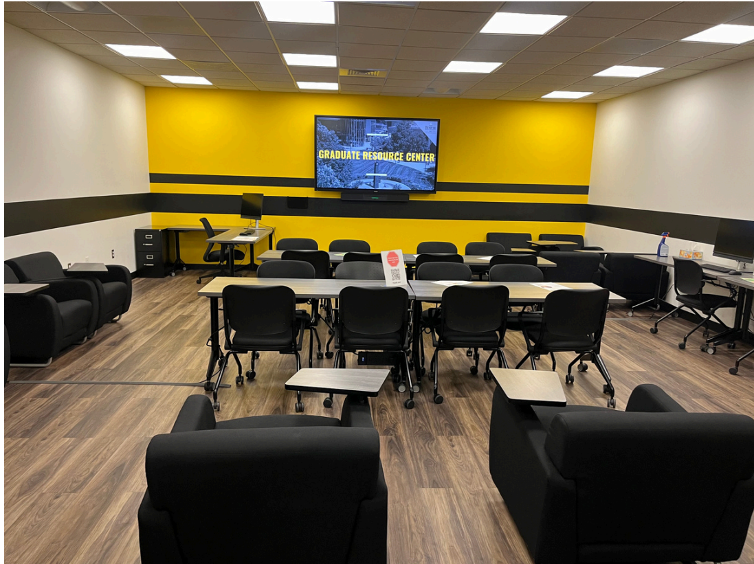
Thurgood Marshall Library, Room 1185

Looking for a space to study, collaborate with peers, or work on assignments? Visit the Graduate Lounge in Thurgood Marshall Library (Room 1185) . This modern space features seating for 30, 7 computers, 3 private study pods, and a large 80" interactive screen with virtual and touchscreen capabilities.