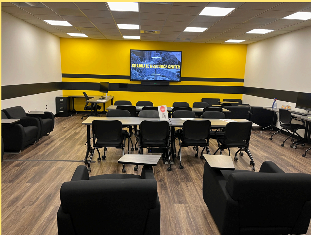
Thurgood Marshall Library, Room 1185

Looking for a space to study, collaborate with peers, or work on assignments? Visit the Graduate Lounge in Thurgood Marshall Library (Room 1185) . This modern space features seating for 30, 7 computers, 3 private study pods, and a large 80" interactive screen with virtual and touchscreen capabilities.