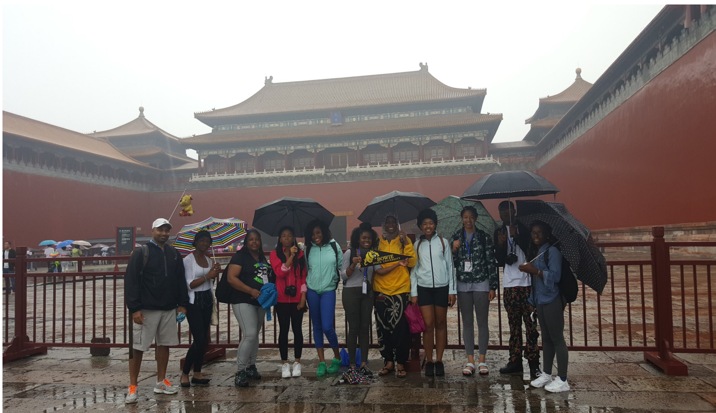
Bowie State University students at the Forbidden City, Beijing, China