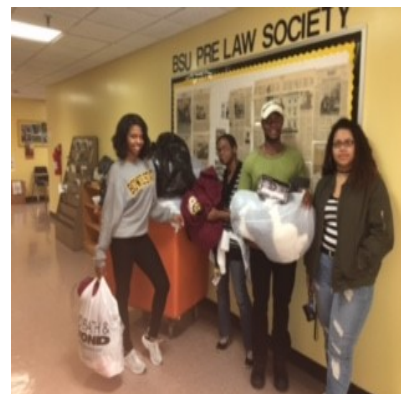
Pre-Law Clothing Drive