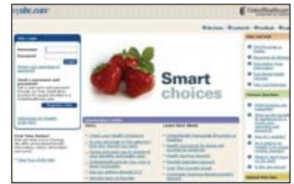
Logging on to myuhc.com

myuhc.com technical support: 1-877-844-4999 8 a.m. – 10 p.m. (EST) Monday – Friday