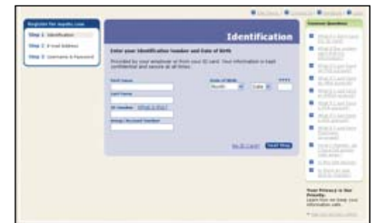
Enter your identification number and Date of Birth or Social Security.