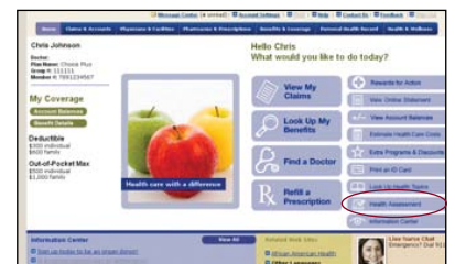
Accessing the Health Assessment