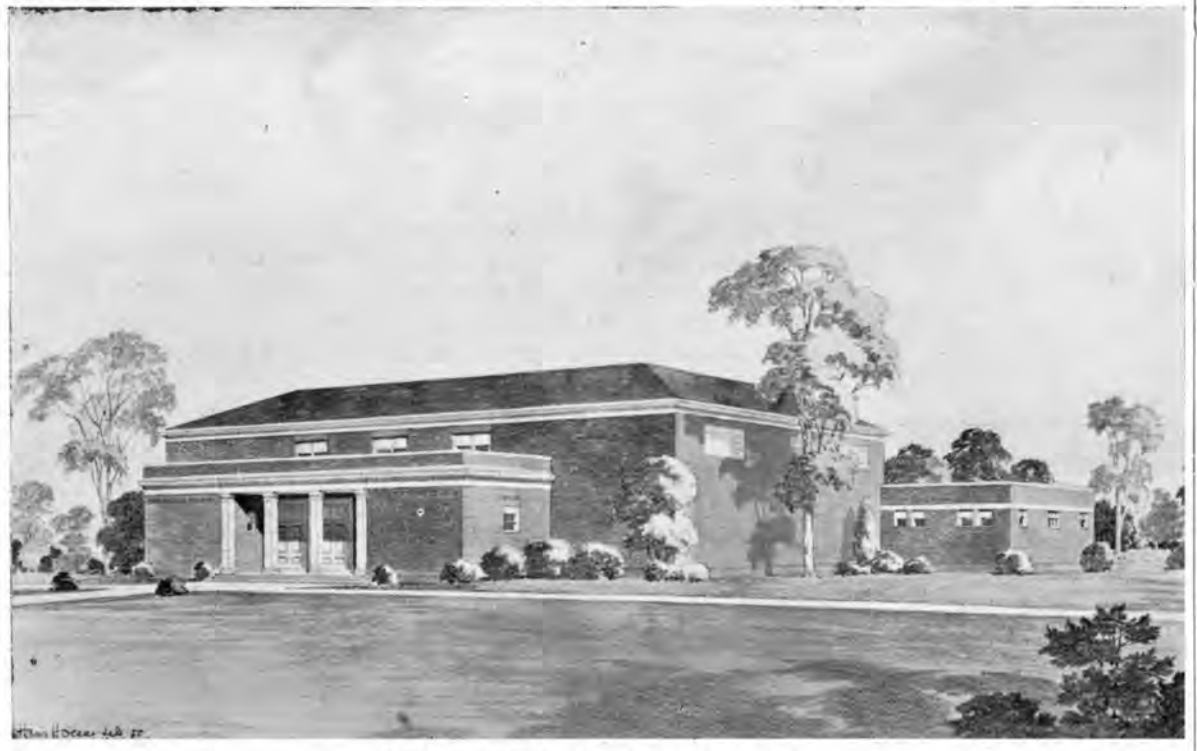
Architect's Drawing of New Gymnasium

The purposes of the Student Conference are to discuss new ideas in the colleges whereby other colleges may profit by the curriculum changes and to discuss other subjects that may affect modern education.