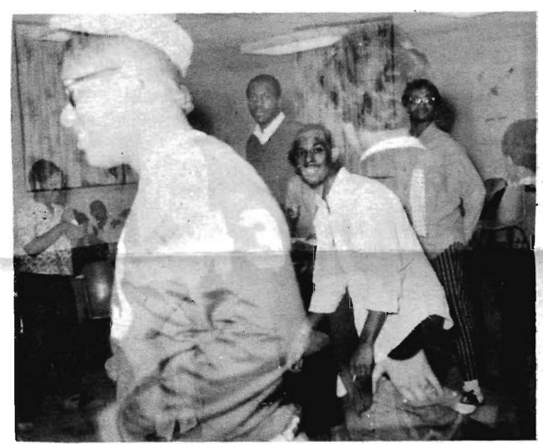
This was the scene of an eventful Monday Night.

Although the "College Ear" Staff is furnishing the award, the staff deals only indirectly with the voting. The business of electing citizens is the responsibility of the students; the counting of the votes will be done by whomever the president of each class designates.