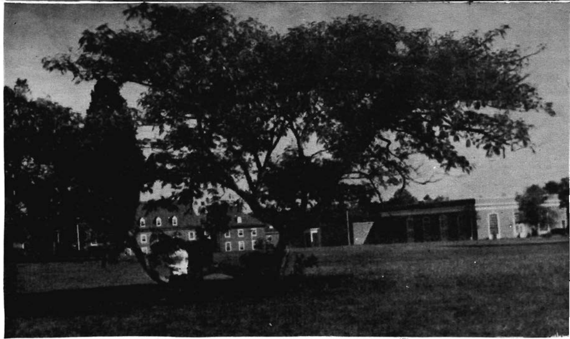
This is the beautiful Mimosa tree that has more visitors than the library.