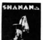
614 SHA NA NA Kamsu LP, 8TR, CASS