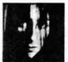
827 CHER Kapp LP, 8TR, CASS