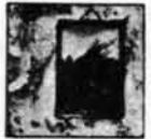
513 LED ZEPPELIN Atlan LP, 8TR, CASS