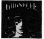
777 GODSPELL Original Cast Bell LP, 8TR, CASS