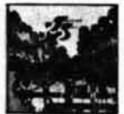
665 JACKSON 5 Goin' Back To Indiana Motown LP, 8TR, CASS