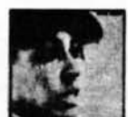
420 IKE & TINA TURNER 'Nuff Said UniAr LP, 8TR, CASS