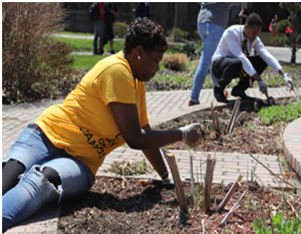
❖ Adopt a Flower Bed