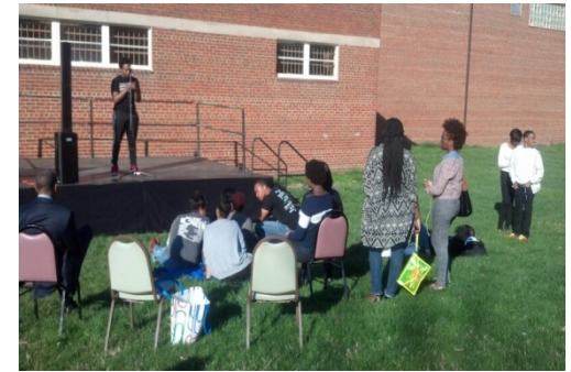
❖ Gaia Poetry Slam