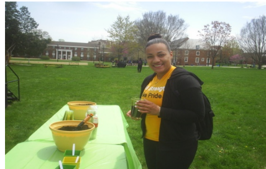
❖ Plant Your Own Food Day