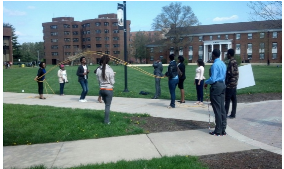
Lights Out Block Party