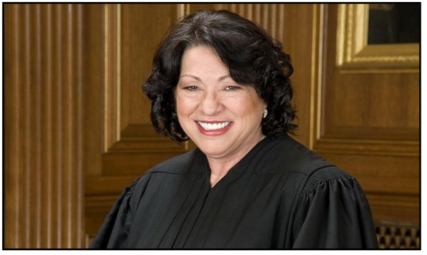
U.S. Supreme Court Justice Sonia Sotomayor