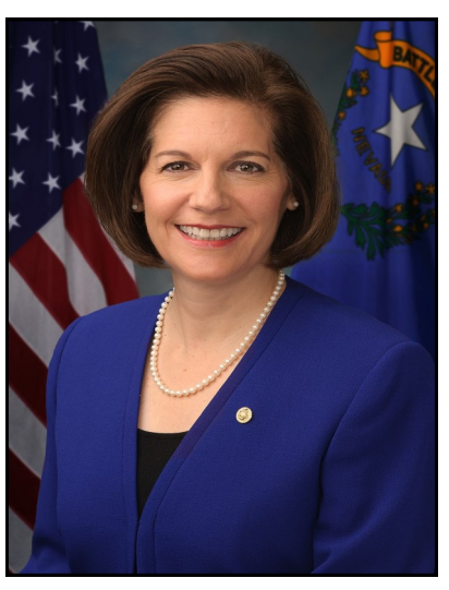
U.S. Senator Catherine Cortez Masto